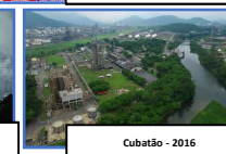
Cubatão - 2016