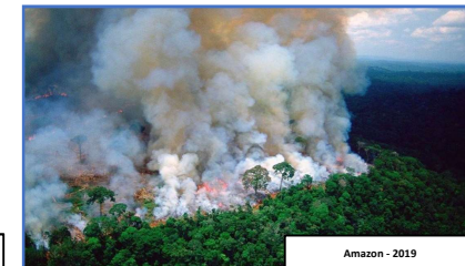
Amazon - 2019