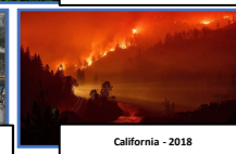
California - 2018