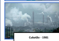
Cubatão - 1981