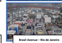
Brasil Avenue - Rio de Janeiro